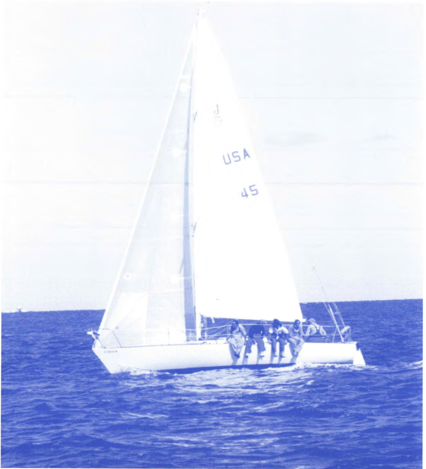
Commodore Wes Maxwell's "COOCH"