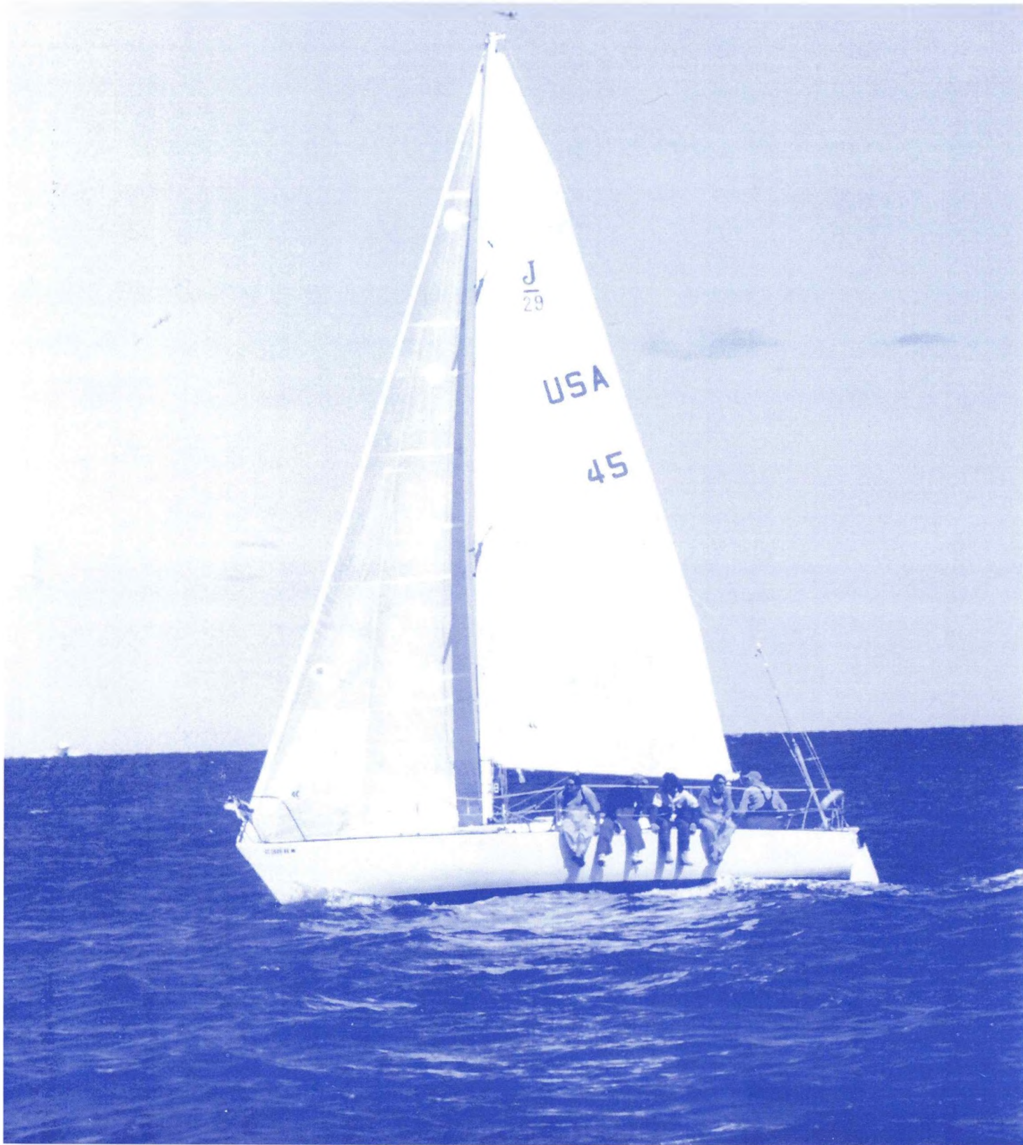
Commodore Wes Maxwell's "COOCH"