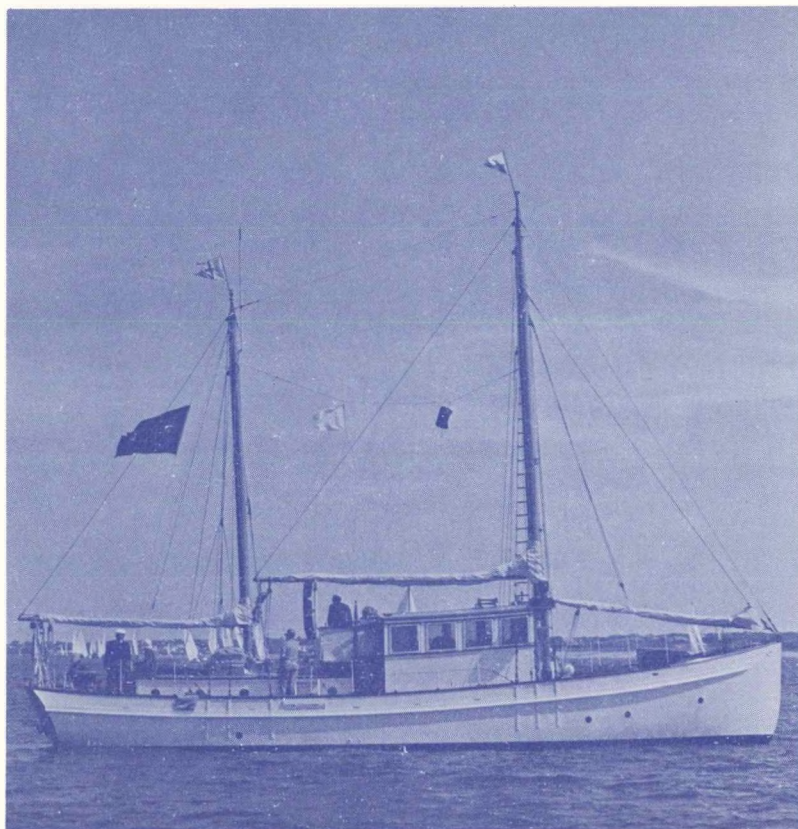
"NOR'EASTER" Off Soundings Committee Boat through the years