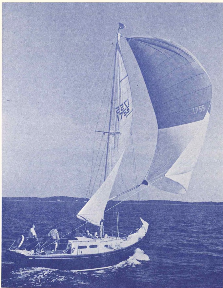
FLAGSHIP "BLACK ARROW" Commodore William L. Ames