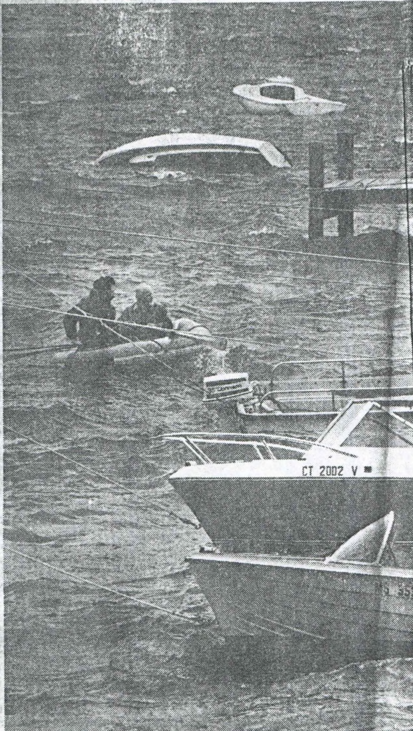
Braving the elements in a raft

Small boat racing was also affected by Friday's storm. The 40 competitors in the 5-0-5 East Coast Championship at the Niantic Bay Yacht Club did not even rig their boats because of the high winds. Several boats were blown off their trailers and at least two masts were broken.