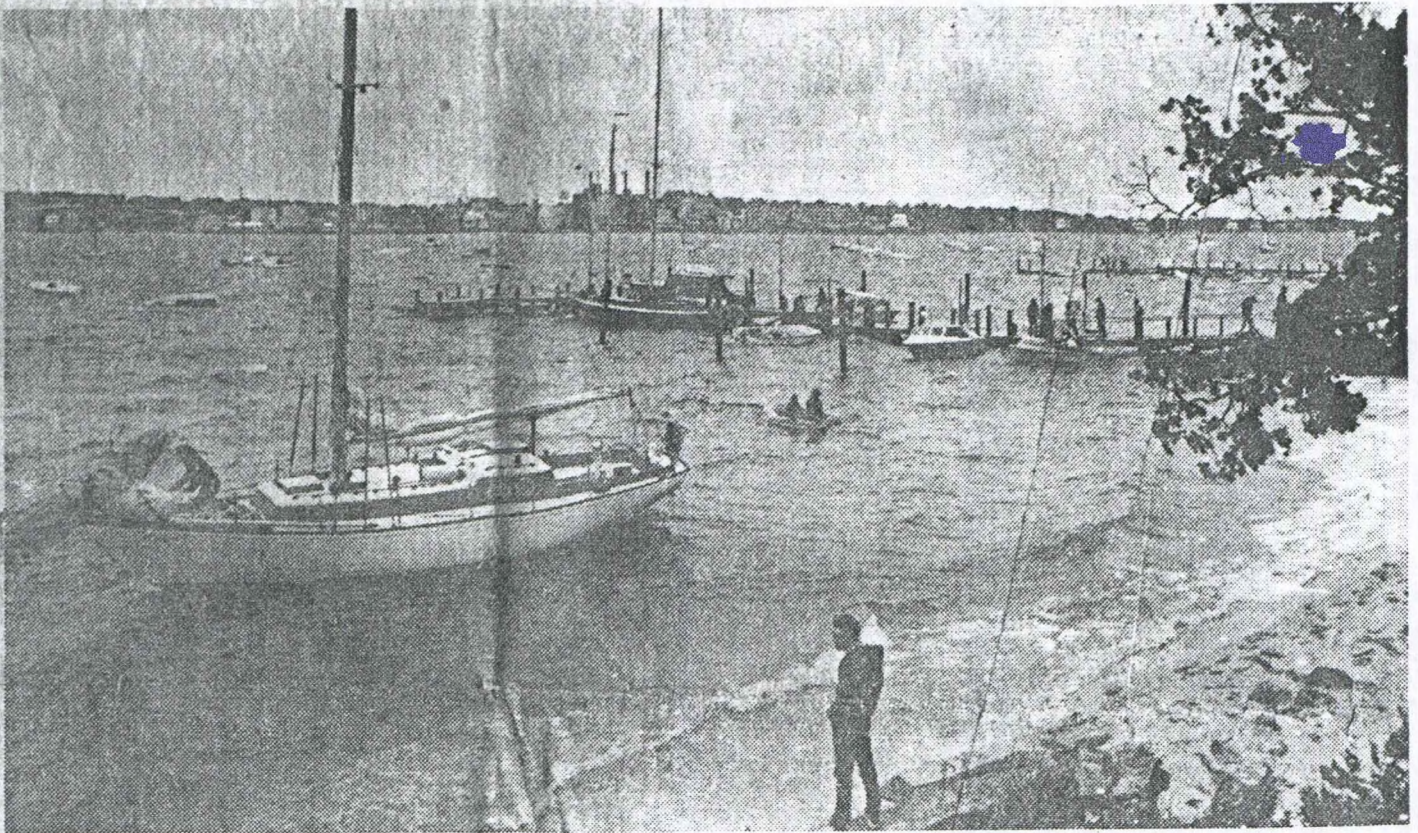
Beached sailboat at Thames Yacht Club

mated 60 or sh the npara- said a to the short, it was safely lub in rry to hand e was noon one to r trips use of ott St., crew- a Mor- nan B. "Per- every 1 said. : race. ne, but prob- ost en-