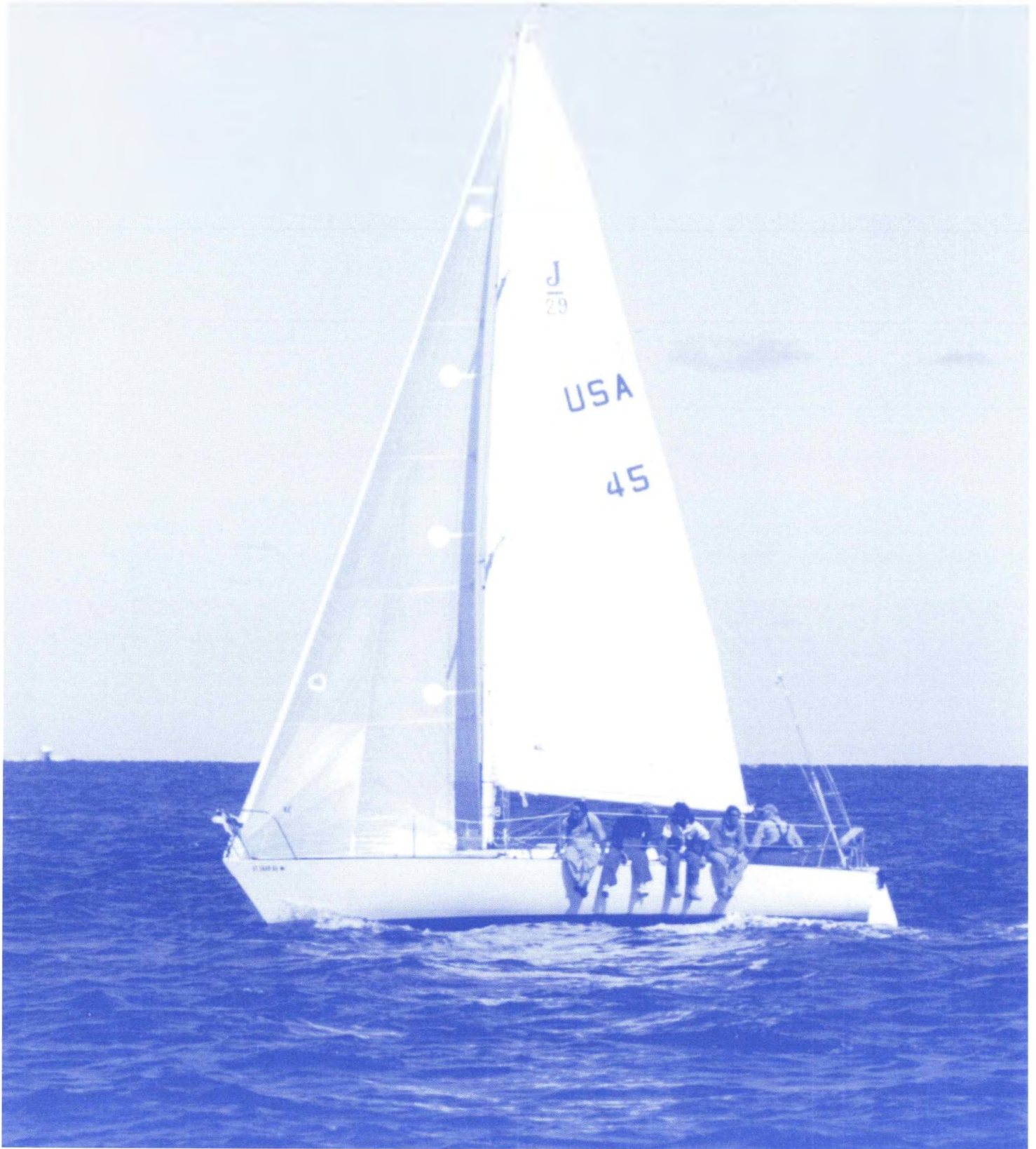
Commodore Wes Maxwell's "COOCH"