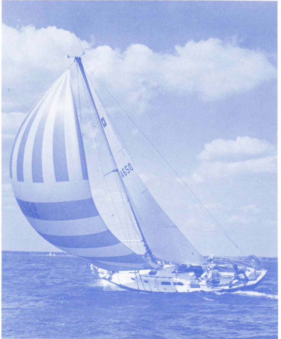
Commodore Porter's Yacht "CHRISADA"